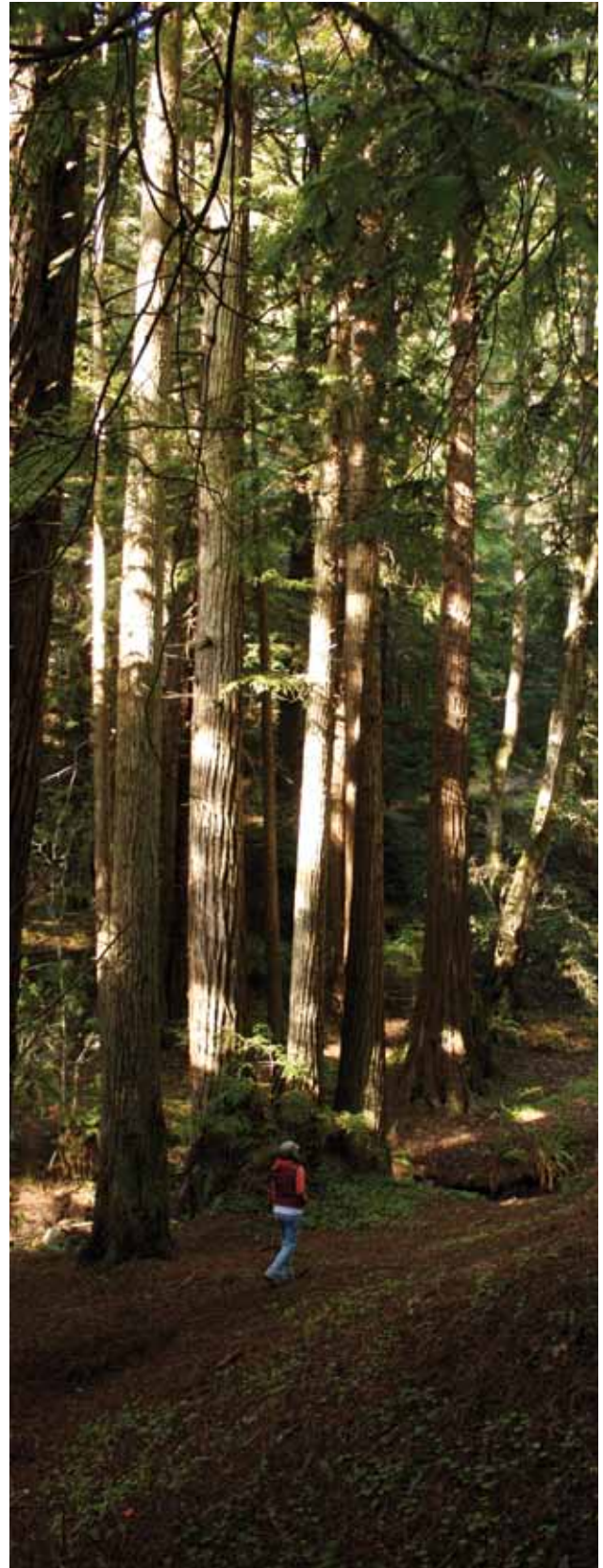
You can dedicate this grove in Purisima Creek Redwoods Open Space Preserve or in 18 other redwood parks.

*Grove donations may be made in one lump sum, over a period of three years, or by bequest.